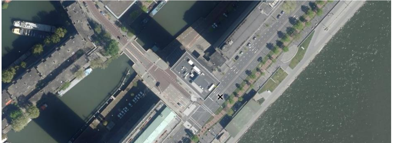
Example nadir from the top.